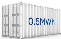
Standard 20ft containers