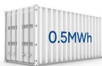
Standard 20ft containers